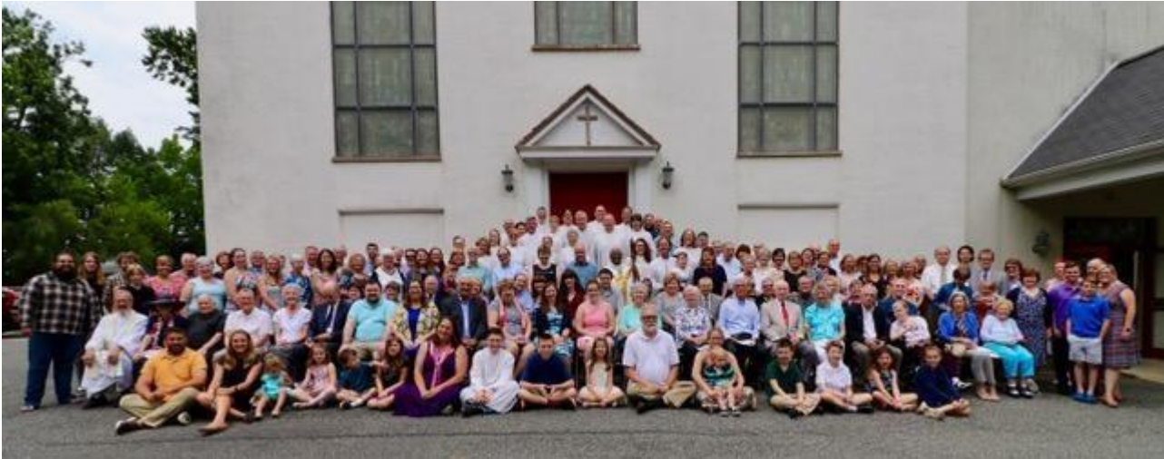
250 th Anniversary Group Photo.