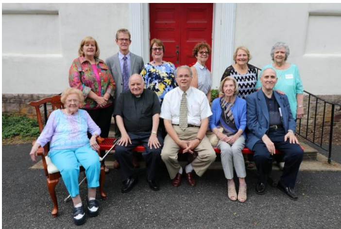
Members present for both the 200 th anniversary in 1969 and the 250 th anniversary.